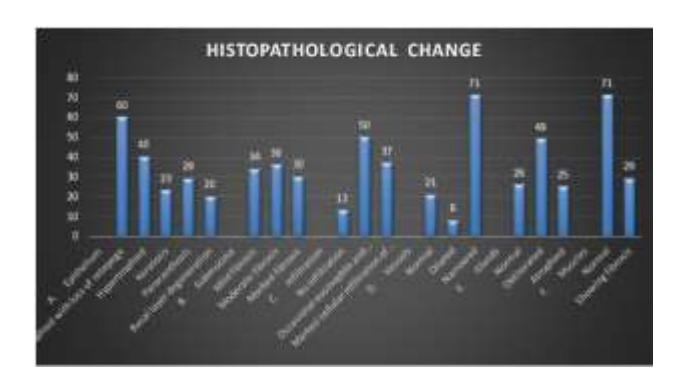
Figure 1: Bar graph showing histopathological changes in 100 patients with OSMF.