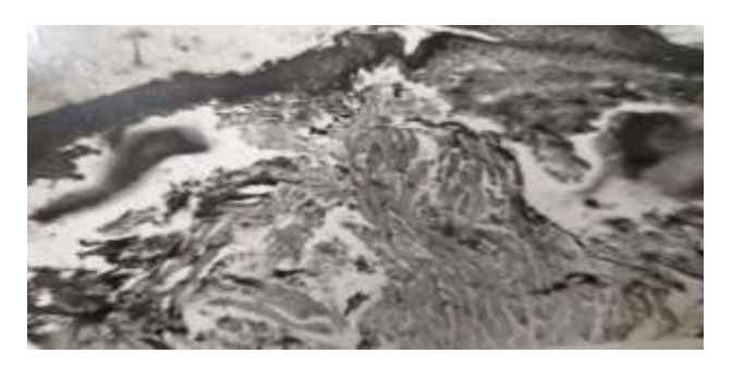
Figure 4: Microphotograph (H and E 80X) showing atrophy of the epithelium with involvement of the muscle fibres in a patient with OSMF.