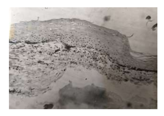
Figure 5: Microphotograph (H and E 80X) showing hyperkeratosis of the epithelium in a patient with OSMF.