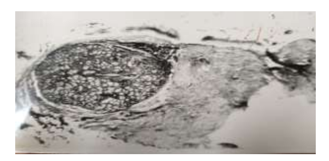
Figure 3: Microphotograph (H and E 80X) showing fibrosis around the alveoli of glandular entities to the extent that some of them appear slit like, suggesting their disappearance in a patient with OSMF.