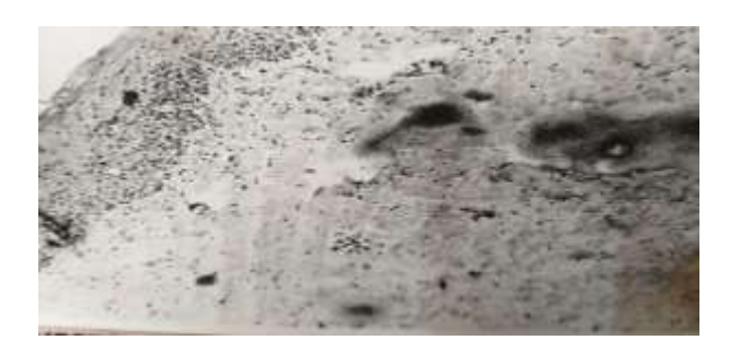
Figure 7: Microphotograph (H and E 80X) showing mucosal hypertrophy rarefaction of submucous fibrous tissue and increased vascularity after treatment in a patient with OSMF.