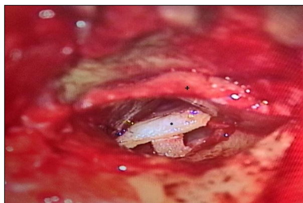
Figure 1: Intraoperative showing strips of conchal cartilage graft arranged by palisade technique and tympanomeatal flap.

There were total of 89 patients operated in 2014-2015 by palisade cartilage fascia tympanoplasty. Of this only 64 patients followed the required post-operative protocol and were selected for the study. Out of 64 patients, 28 were males and 36 were females.