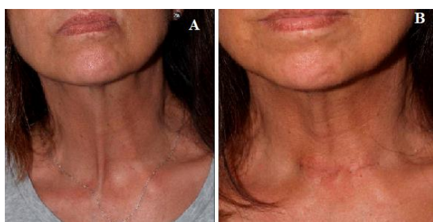
Figure 3: (A) Preoperative aspect (B) immediate postoperative appearance after 15 days.

The average follow-up is 12 months (minimum 10, maximum 24). Immediate operative follow-up may be marked by the presence of ecchymosis at the section site. Immediate (Figure 3) and late postoperative appearance of the scar is satisfactory. The assessment of the patient's satisfaction is made at 1 month, 3 months, 6 months, and a year. The assessment takes into account the scar and the patient's feelings about the initial operation.