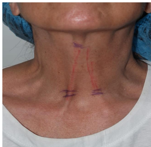
Figure 1: Marking the area to be incised.

The intervention is performed in the operating room. The procedure is performed under local anaesthesia. Our intervention consisted of a demographic pencil marking of the medial platysma band and on the incised area (Figure 1). This was done with the patient sitting and lying, with and without extension of the head to mark the skin projection of the platysma. The patient is placed supine on the operating table in cervical hyperextension.