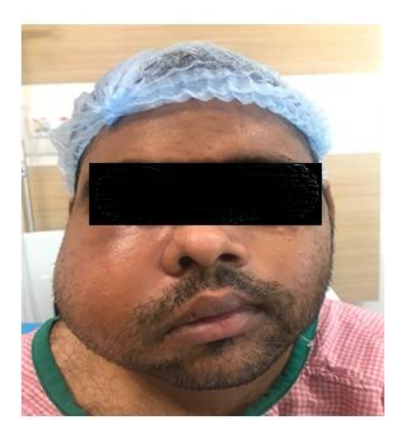
Figure 1: Preoperative picture of the swelling over right maxillary region.

A CT scan of the paranasal sinuses with 3D reconstruction demonstrated an expansile lytic lesion measuring 5 x 4.3 x 5.4 cm centred within the right maxillary sinus, with the bony origin from the anterolateral wall and the floor of right maxilla. The right maxillary sinus was found to be thinned out due to bony remodelling and dehiscent anterolaterally with extension of the mass into the soft tissues of premaxillary region. There was involvement of superior alveolar process due to its extension inferiorly with resorption and blunting of roots of premolar and molar teeth. Superior, posterior and medial walls of the maxillary sinus were thinned out with extension into the infratemporal fossa (Fig.2).