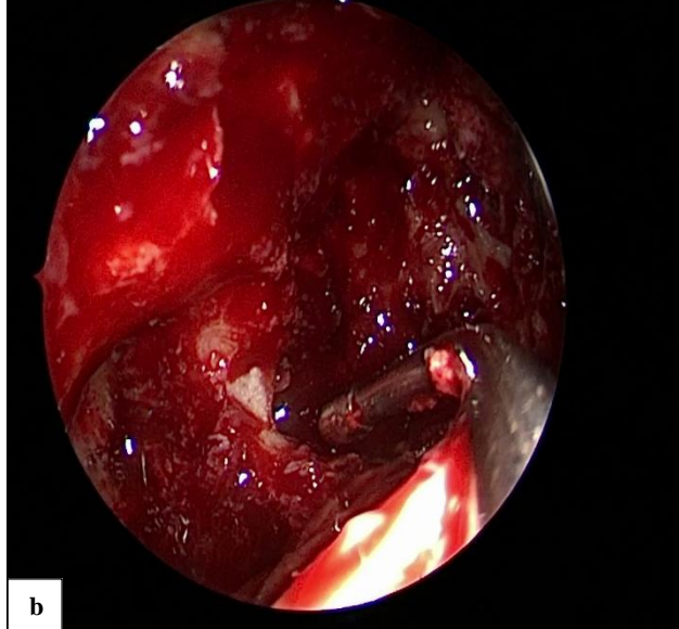
Figure 2: (a) Coronal computed tomogram showing the lesion within the right maxilla antrum; (b) intra operative picture showing dissection from right infratemporal fossa.