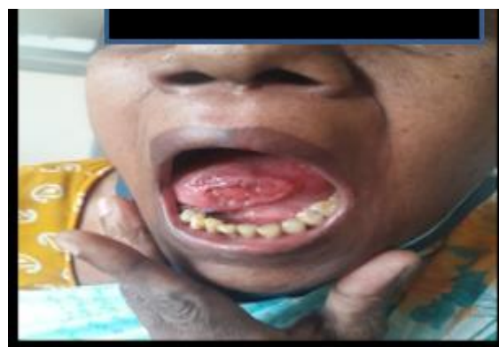
Figure 2: Carcinoma tongue.

History of alcohol intake was present in 13 patients and 8 patients had history of both smoking and alcohol. 48 did not have any risk factors. Out of 27 patients with malignant ulcers, smoking, alcohol, history was present in 8 patients, history of alcohol intake was present in 13 patients and history of both smoking and alcohol intake was present in 6 patients.