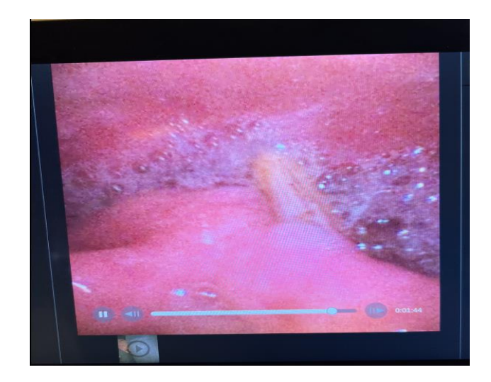
Figure 2: Flexible laryngoscopy.