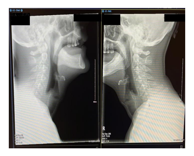
Figure 1: X-ray neck lateral view.

the removal of dentures from the hypopharynx and cricopharyngeal region using optical forceps. The patient's postoperative recovery was uneventful and he was able to resume a normal diet after six hours.